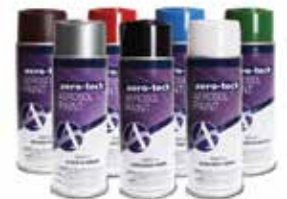
PAINTS & CHEMICALS