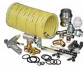
FITTINGS & HOSE