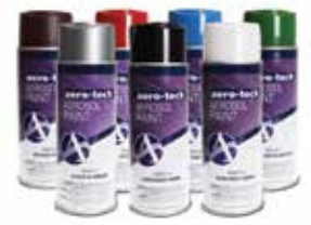
PAINTS & CHEMICALS