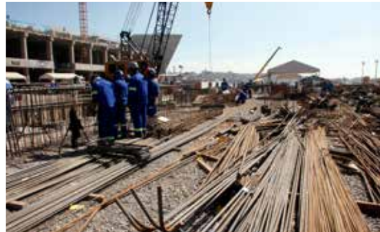
Heavy Civil Construction