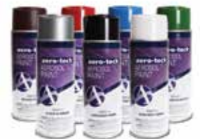
PAINTS & CHEMICALS