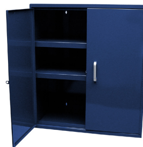
Utility Cabinet #106524195 | B01069