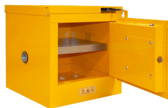
2 Gallon Flammable Cabinets #116740416 | DM-1002M-50 Manual #116740421 | DM-1002S-50 Self Closing