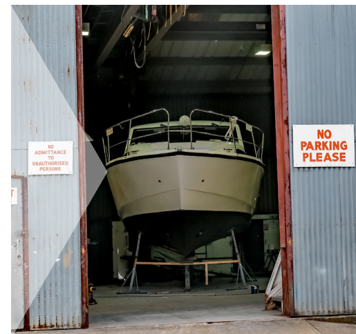
Chart your course to success with MRO supplies to propel you forward