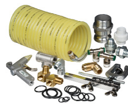
FITTINGS & HOSE