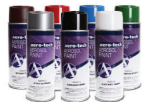
PAINTS & CHEMICALS